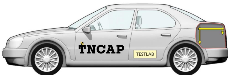
Figure 1 Setting up axis reference frame

3.1.2.1.6 Locate the vehicle axis reference frame (see Figure 1) centrally to the rear of the vehicle.